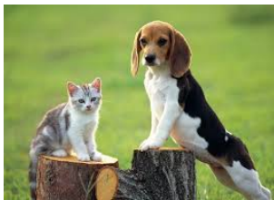
A CAT AND A DOG