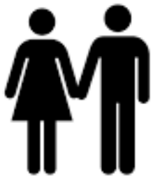
A WOMAN AND A MAN