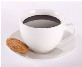
A COFFEE AND A COOKIE